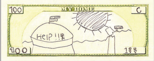
FUNDRED bill drawn by teen evacuated to Tennessee

Be a part of the FUNDRED DOLLAR BILL PROJECT, an artwork CONNECTING + COLLECTING the voices of our country's youth. Simply start with our worksheet and draw your own FUNDRED DOLLAR BILL. When you contribute your drawing to the collection your artwork will support a solution to help end childhood lead poisoning.